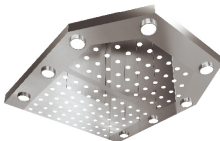
D58052 选配 Optional

圆形荷花图案工艺板造型及后部叫筒灯的柔光照明设计 Round lotus design art panel model, soft lighting design of rear down lamp