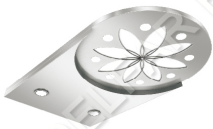
D58055 选配 Optional

Central part: Acrylic lighting decoration Frames around: Mirror St. St frame